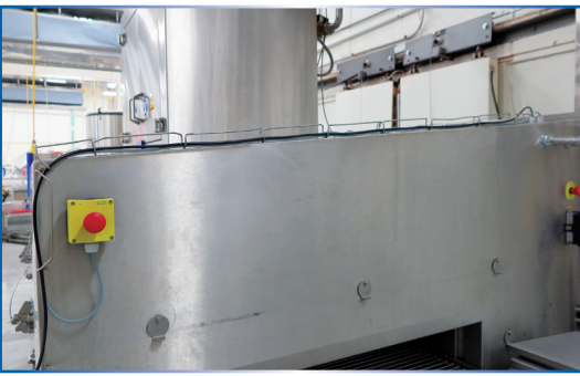
HYGIENICALLY DESIGNED SLOPED SURFACES FOR WATER RUNOFF