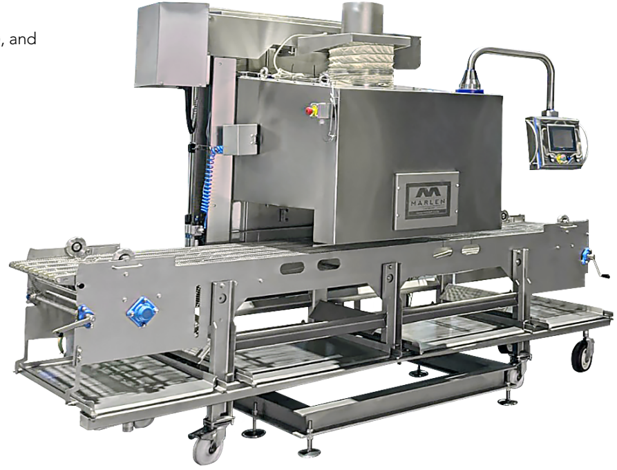
Stand-Alone 600mm Afoheat Grill-Marker