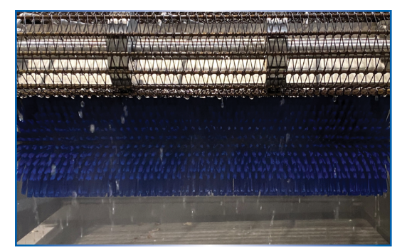
INTEGRATED BELT WASH